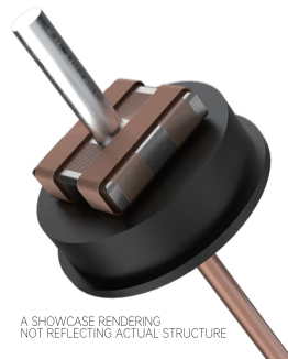
A SHOWCASE RENDERING NOT REFLECTING ACTUAL STRUCTURE