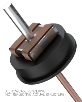
A SHOWCASE RENDERING NOT REFLECTING ACTUAL STRUCTURE