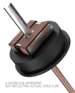
A SHOWCASE RENDERING NOT REFLECTING ACTUAL STRUCTURE