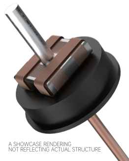
A SHOWCASE RENDERING NOT REFLECTING ACTUAL STRUCTURE