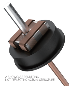
A SHOWCASE RENDERING NOT REFLECTING ACTUAL STRUCTURE